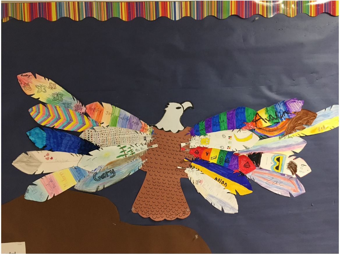
Division 15 and the “Courage to Fly”

Our New Kindergarten Bathroom! Thank you to our District Staff!